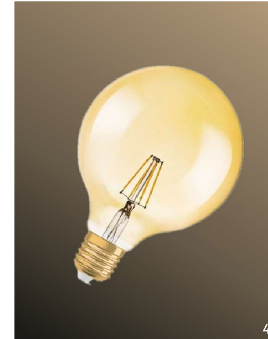
Abb. 1 dimmbar, CRI >80

L01-RF1906CLASST Filament goldgedä. E27 2500K 725lm 7,5W L/Ø: 145/64mm