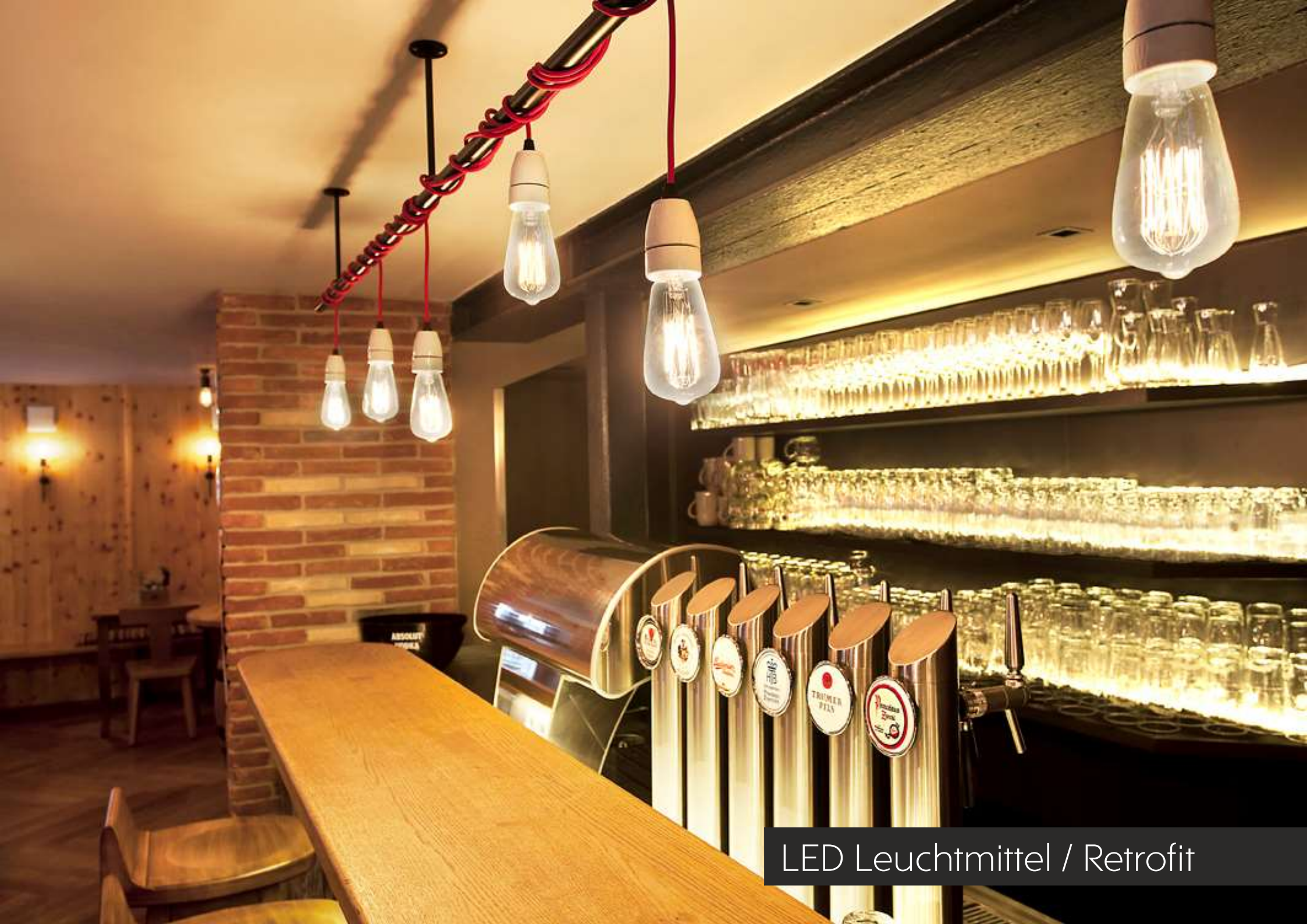
LED Leuchtmittel / Retrofit