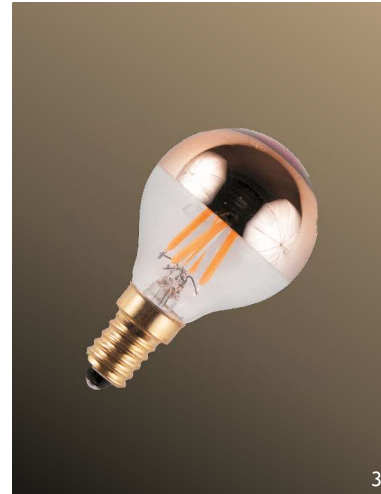
Abb. 1 dimmbar, CRI >80

L01-FILC3527 Filament klar E14 2700K 470lm 5,0W L/Ø: 97/35mm