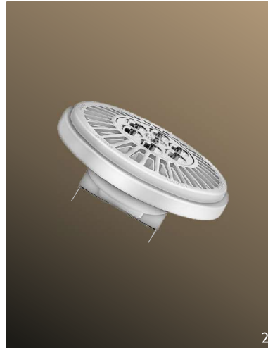
Abb. 1 dimmbar,