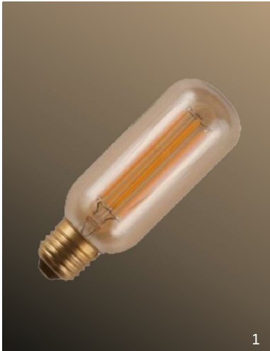
Abb. 1 dimmbar, CRI >90

L01-L023833305 Filament goldgedä. E27 2500K 480lm 6,5W L/Ø: 130/45mm