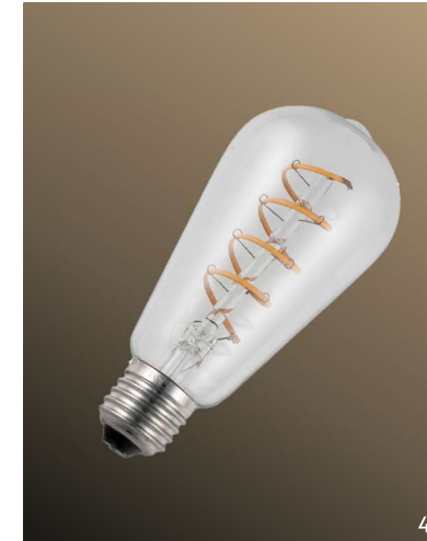
Abb. 1 dimmbar, CRI >95

L01-FILAGL2727 Filament klar E27 2700K 806lm 8,0W L/Ø: 112/67mm